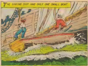
THE SAILING SHIP HAD ONLY ONE SMALL BOAT

IT HELD ONLY HALF ITS MEN SLOWLY, IT MADE ITS WAY TOWARD THE ROSE OF DEVON